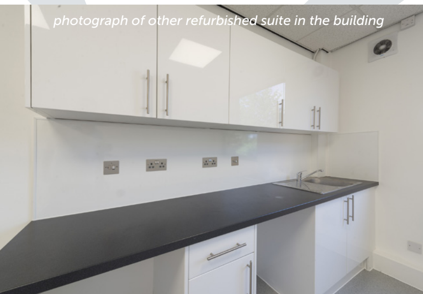
photograph of other refurbished suite in the building