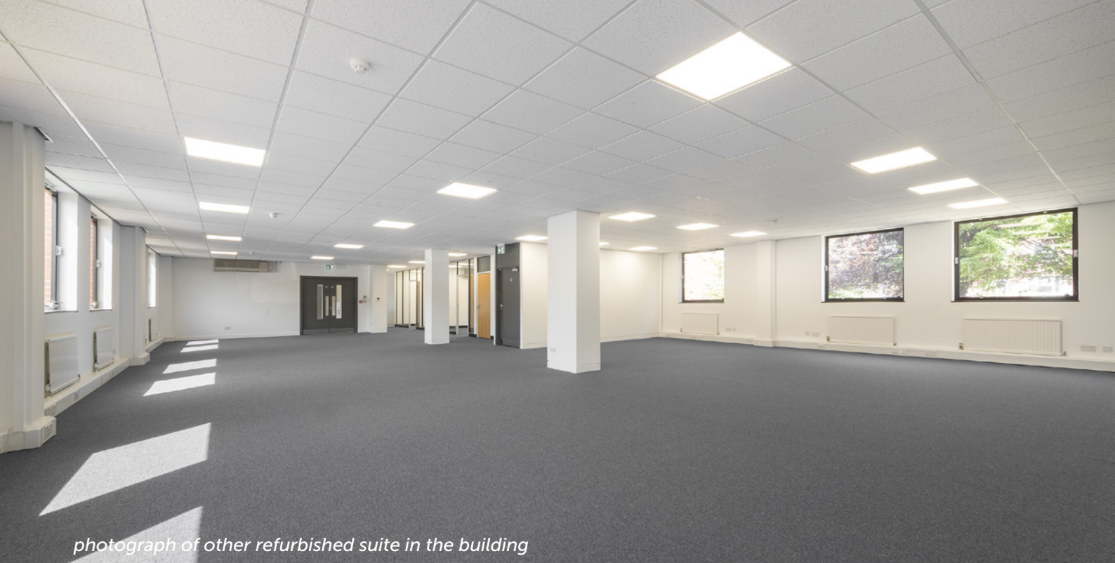
photograph of other refurbished suite in the building